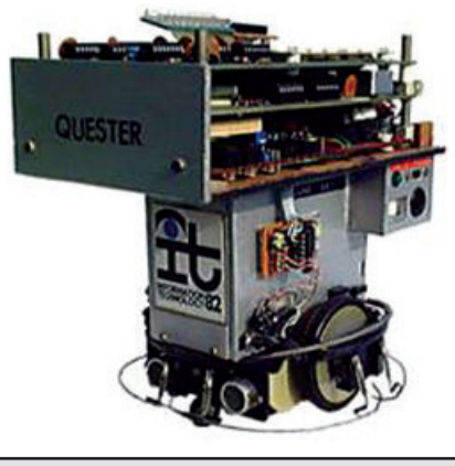
FIGURE 2. Quester from the UK.

Buckley gained a bit of fame when Quester was featured in one of the earliest non-industrial robot magazines, Robotics Age . The First World Micromouse Competition was held in Tsukuba, Japan in 1985 and the top six winners were all locals. After a few sporadic contests in the US with low attendance and few