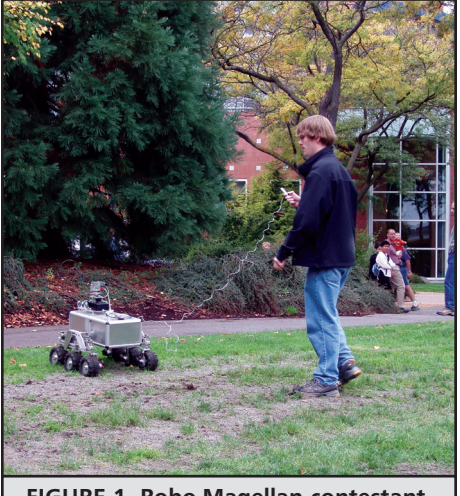
FIGURE 1. Robo-Magellan contestant.

inches high, or so. They must weigh less than 50 pounds and fit within a four foot cube for the duration of the race. Some crawl away from the starting point at a speed slower than a stroll in the park and others race away at breakneck speeds. I've seen contestants running behind their speeding Robo-Magellan robot, barely able to keep up, with the safety tether in their hand ready for an emergency stop.